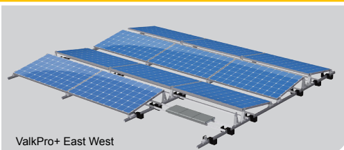
ValkPro+ East West