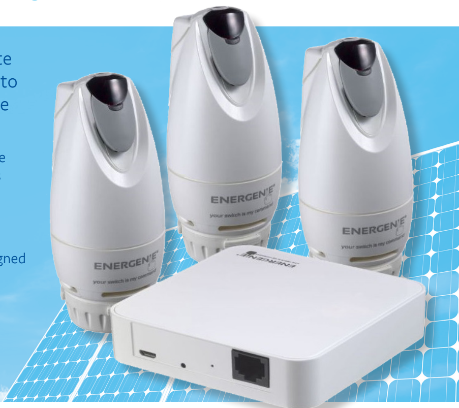
Wireless eTRV valves & Hub

Control is through your phone, tablet or PC allowing the customer complete control of heating, lighting and domestic loads.